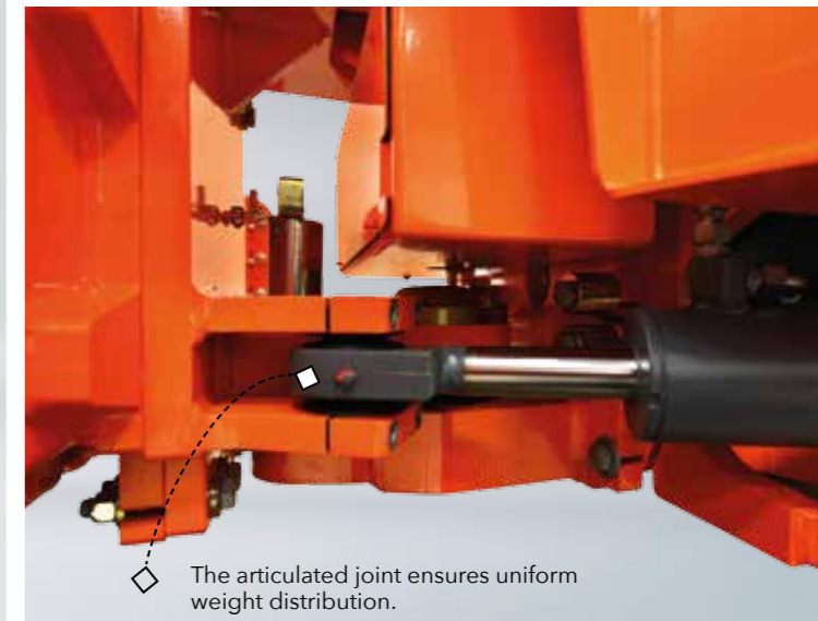
The articulated joint ensures uniform weight distribution.

The HAMM 3-point articulation is the key to an exceptionally favourable weight distribution, enormous driving stability and supreme traction.