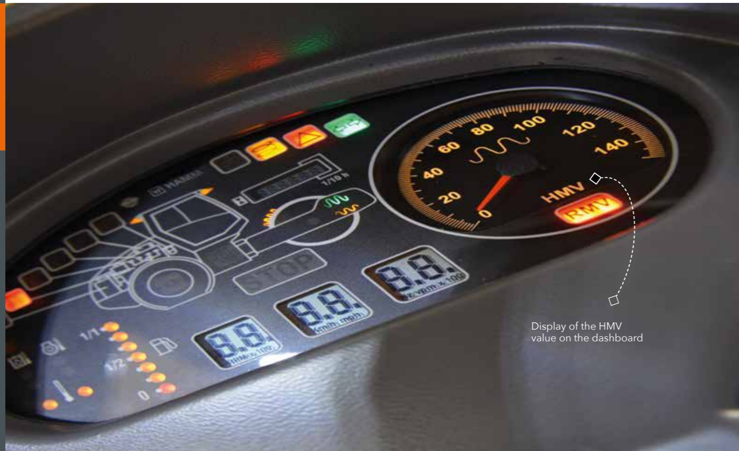
Display of the HMV value on the dashboard